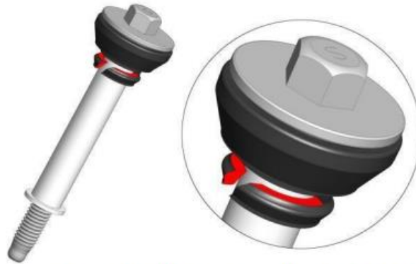
Figure 1 – Factory LS Valve Cover Hardware Assembly

These valve covers do not include valve cover mounting bolts or rubber grommets. You may reuse the factory bolt assemblies, or other factory hardware of your choice. Replacements may be necessary over time.