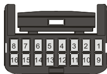
HARNESS SIDE VIEW