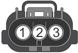
HARNESS SIDE VIEW