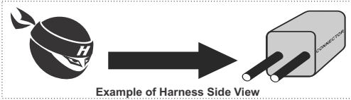
Example of Harness Side View