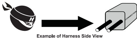
Example of Harness Side View

VIDEO: How To Crimp Like A Pro http://bit.ly/haltechcrimp