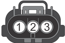
HARNESS SIDE VIEW